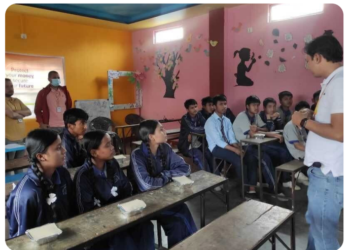
Financial Literacy Program conducted by various branches during the Global Money Week 2024