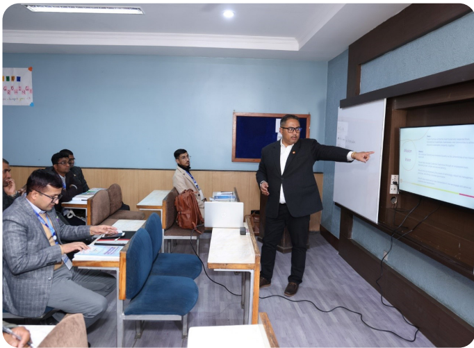
Financial Literacy session provided to Nepal English Language Teacher's Association (NELTA)

We are pleased to publish our Q3 (80/81) synopsis of Corporate Social Responsibility (CSR) report. This report is a periodical document and reflects our efforts in making a positive impact on society, the environment, & the community we serve. With the increasing focus on sustainability, this quarterly report states how we continue to contribute to the world. Below are a few highlights of our actions & results, & inspiring others to do the same.