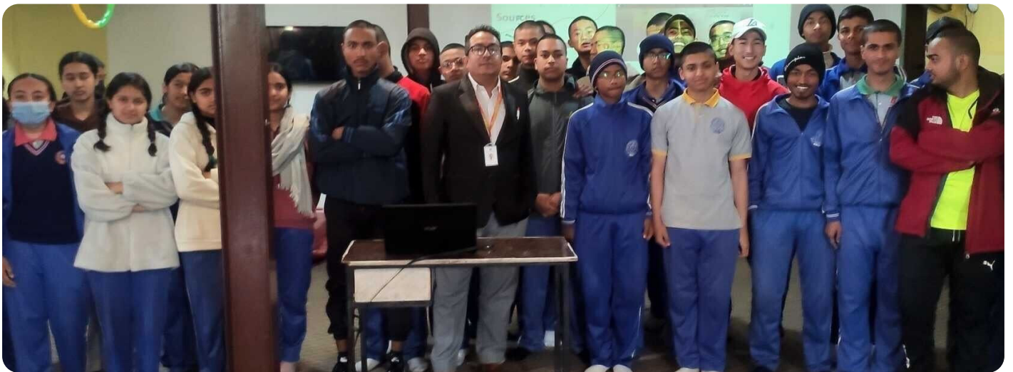
Financial Literacy Program conducted by various branches during the Global Money Week 2024