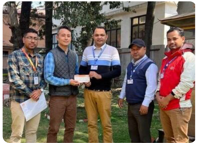
Support to Nepal Anti Tuberculosis Association (NATA)