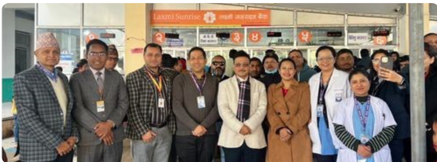
Installation of Queue Management System at Rapti Academy of Health Science ( RAHS)