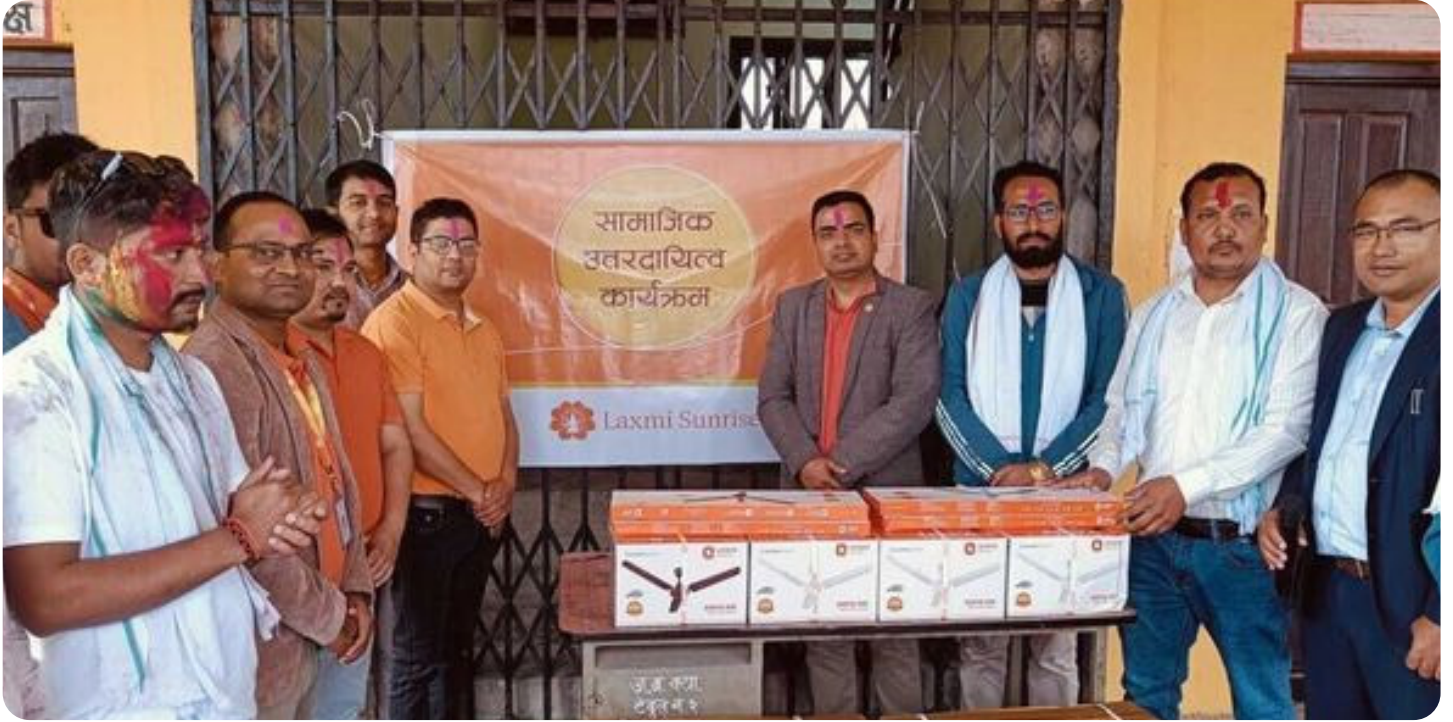
Electric Fan distribution to Janjyoti Multiple Campus, Rautahat